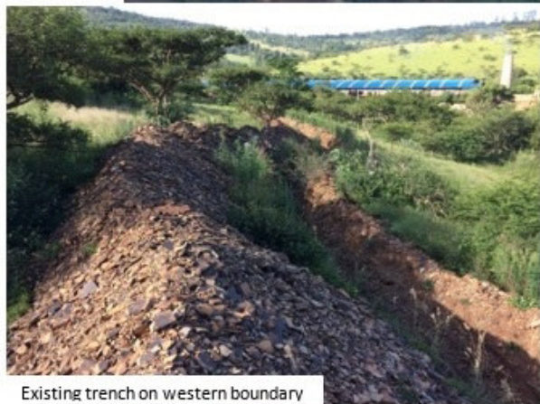
Existing trench on western boundary