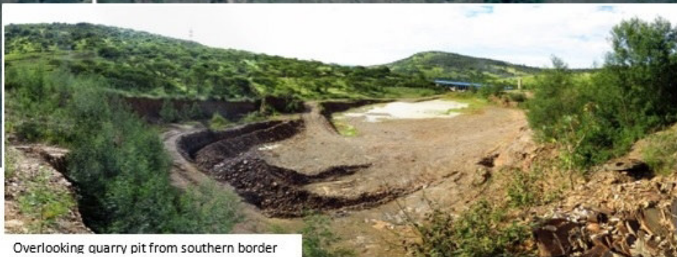
Overlooking quarry pit from southern border