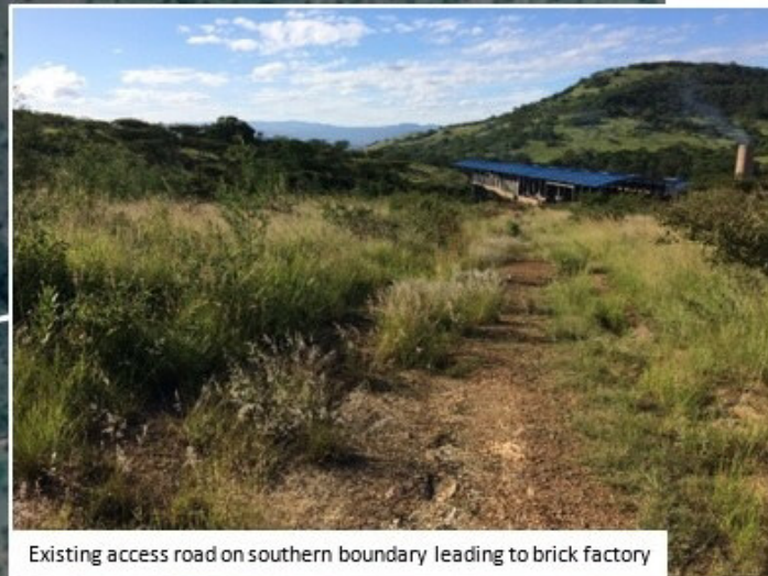
Existing access road on southern boundary leading to brick factory