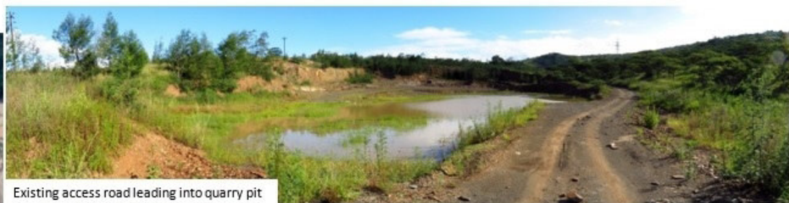
Existing access road leading into quarry pit