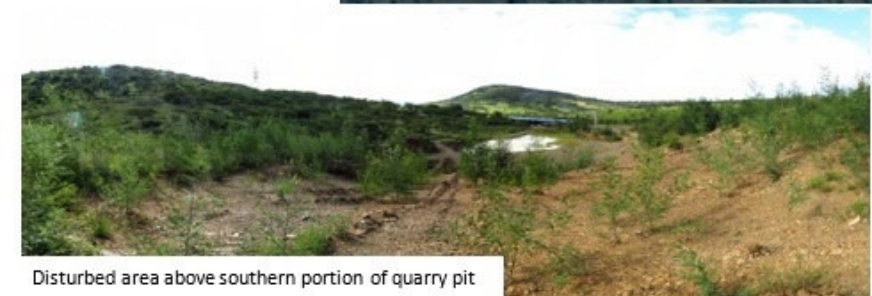
Disturbed area above southern portion of quarry pit