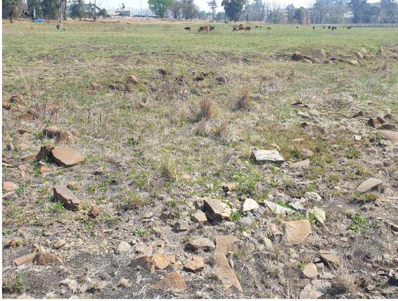
Figure 3: Dolerite outcrop observed on the area where the culvert is proposed