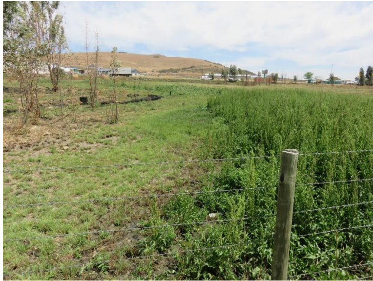
Figure 1: Wetland observed within the 500m radius of the project site