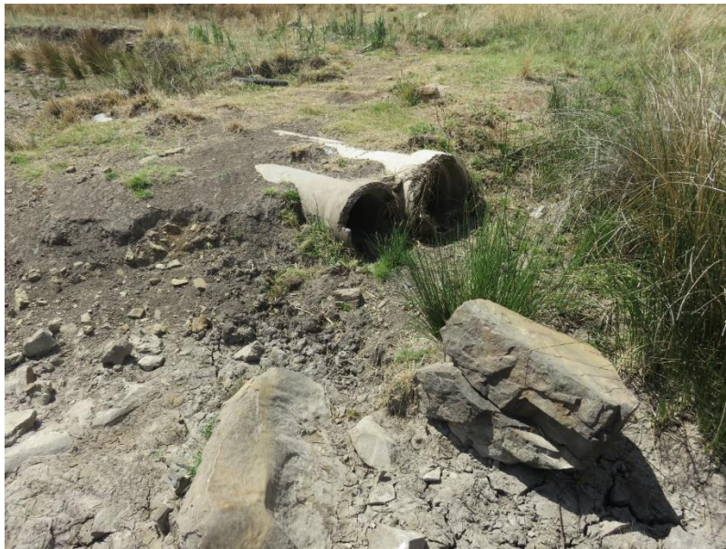
Figure 4: Additional stormwater management infrastructure observed within the project site