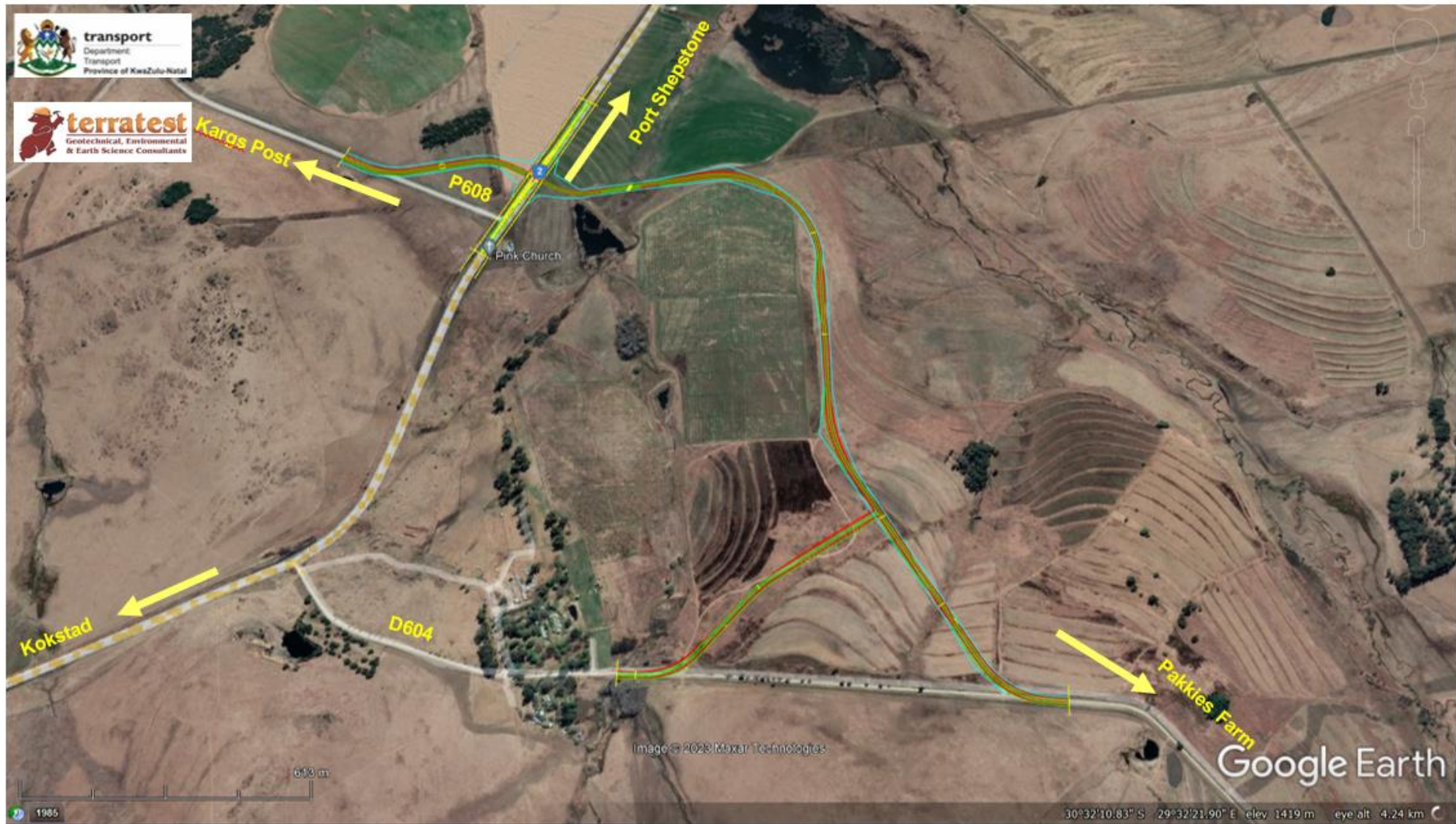
Figure 1: Locality map and layout for the proposed development